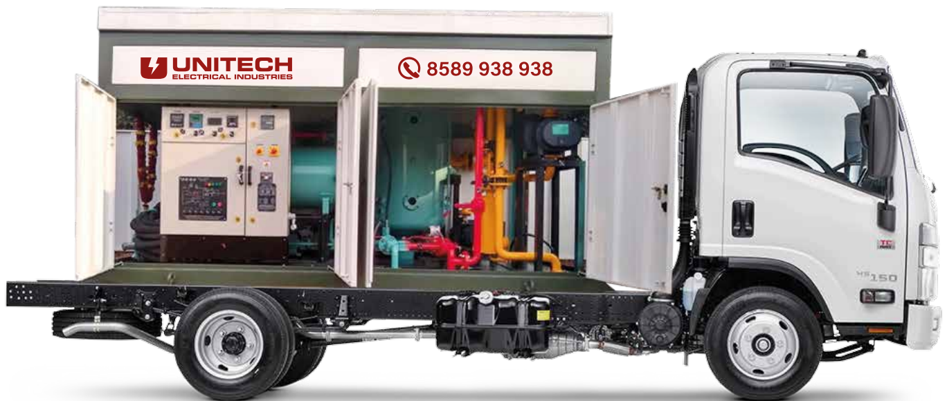
Mobile Transformer Oil Filtration Unit