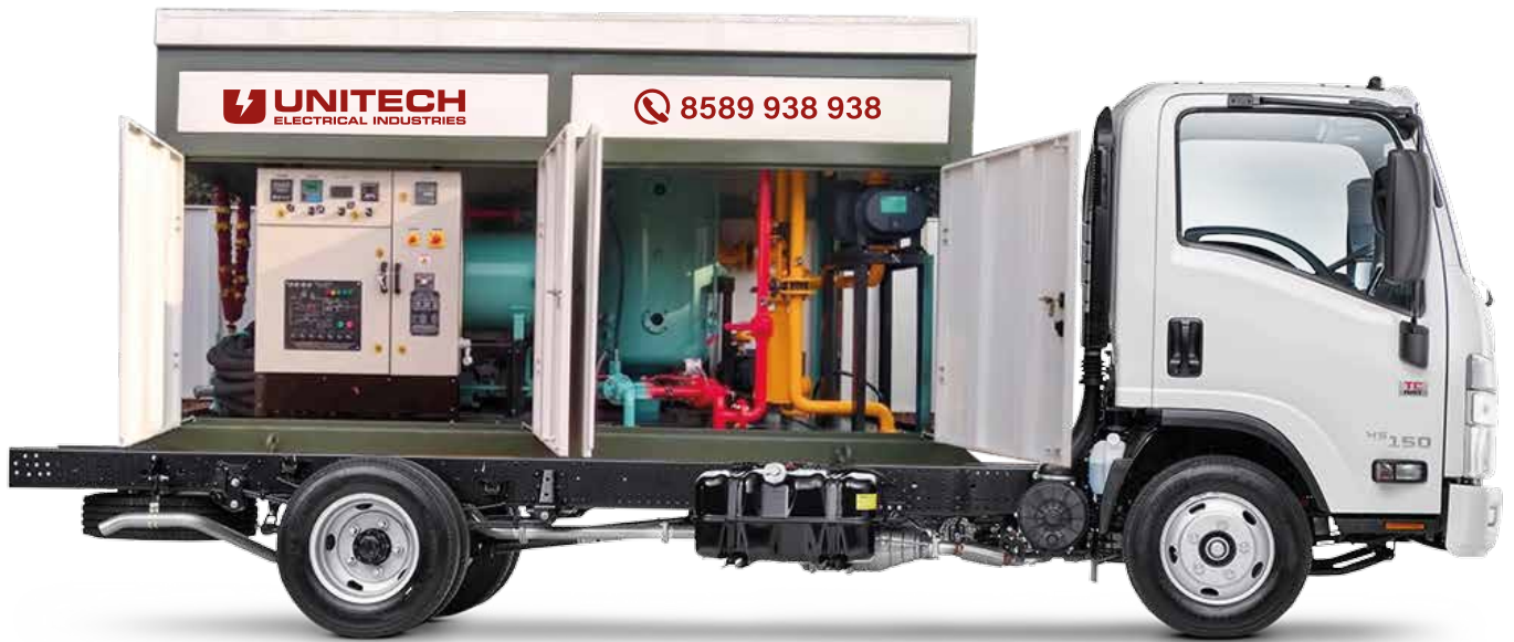
Mobile Transformer Oil Filtration Unit